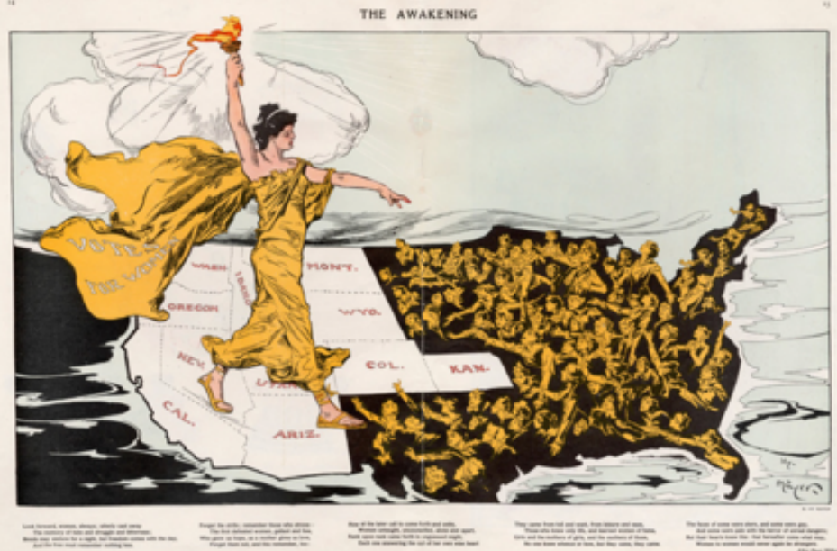
From The Smithsonian's National Portrait Gallery "Votes for Women: A Portrait of Persistence."