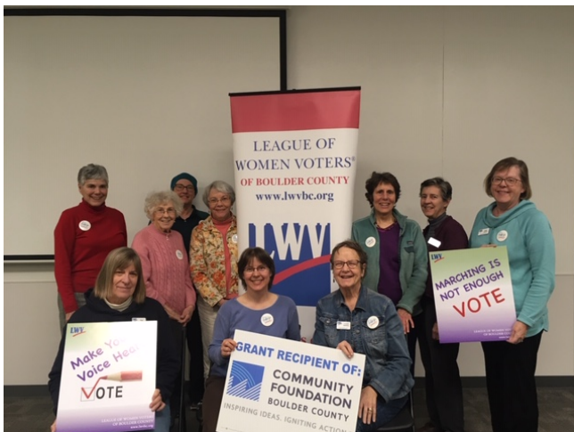
Longmont Planning Meeting

Is participation meeting expectations? Exceeding: 9 members. Completely meeting expectations: 27 members. Somewhat: 18 members. Not meeting expectations at all: 1 member. 9 members didn't answer the question.