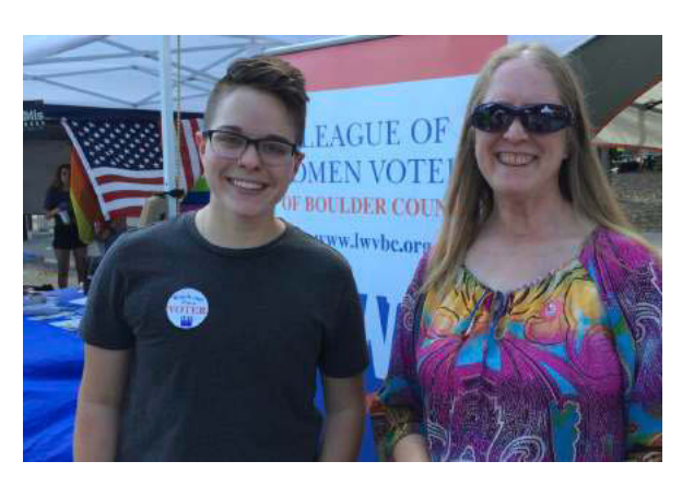
LWV members and friends visit our booth at the Boulder Famrer's Market

Erie: August 16<sup>th</sup>, 4:00 to 8:00 p.m.