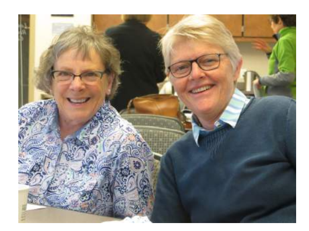
Social Policy Team Leader power!

League of Women Voters of Boulder County PO Box 21274 Boulder, CO 80308